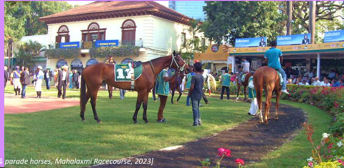
[Jockeys & Stable hands exercise & parade horses, Mahalaxmi Racecourse, 2023]